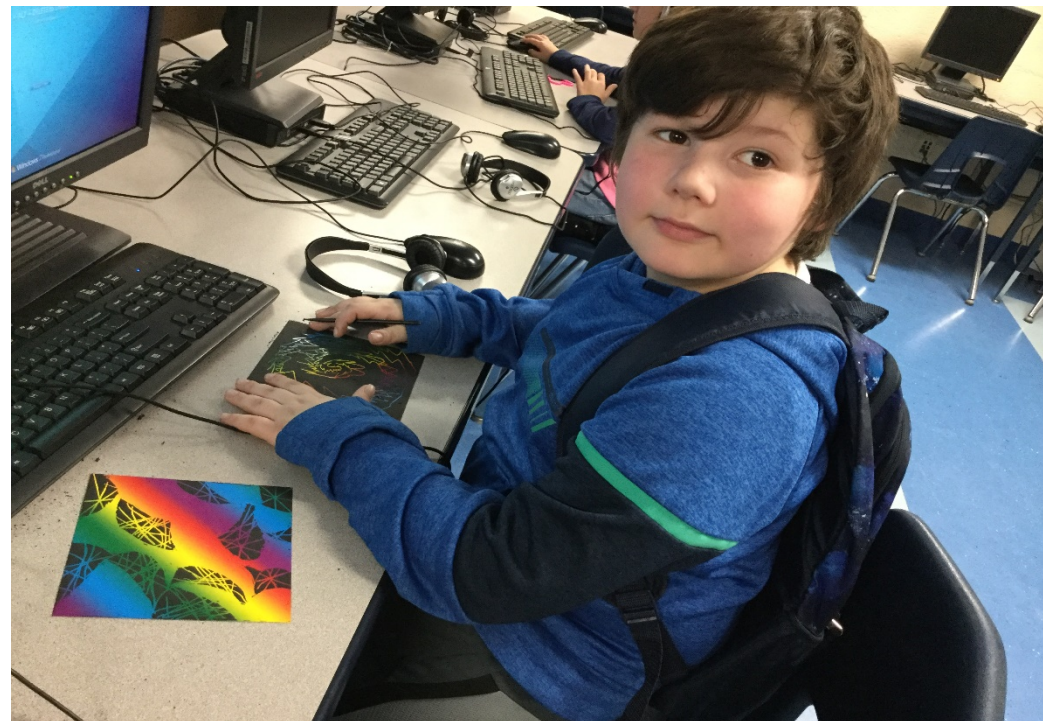
Scratch art brings out a student's creativity at Lizemore Elementary.