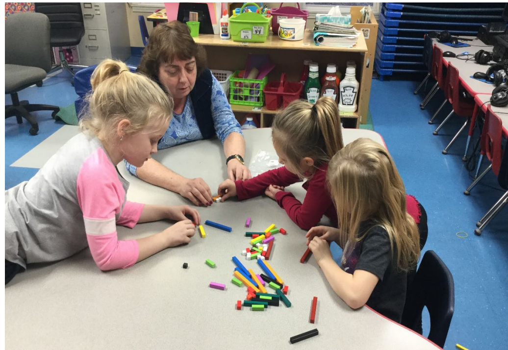
Cuisenaire Rods are used to reinforce addition skills at Lizemore Elementary.