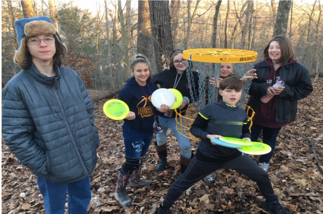
Disk golf anyone? Members of the Clay Middle Outdoor Adventure Club enjoy time outside.