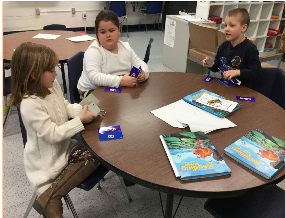
Homework time is the perfect time to review sight words for K-1 students at Clay Elementary.