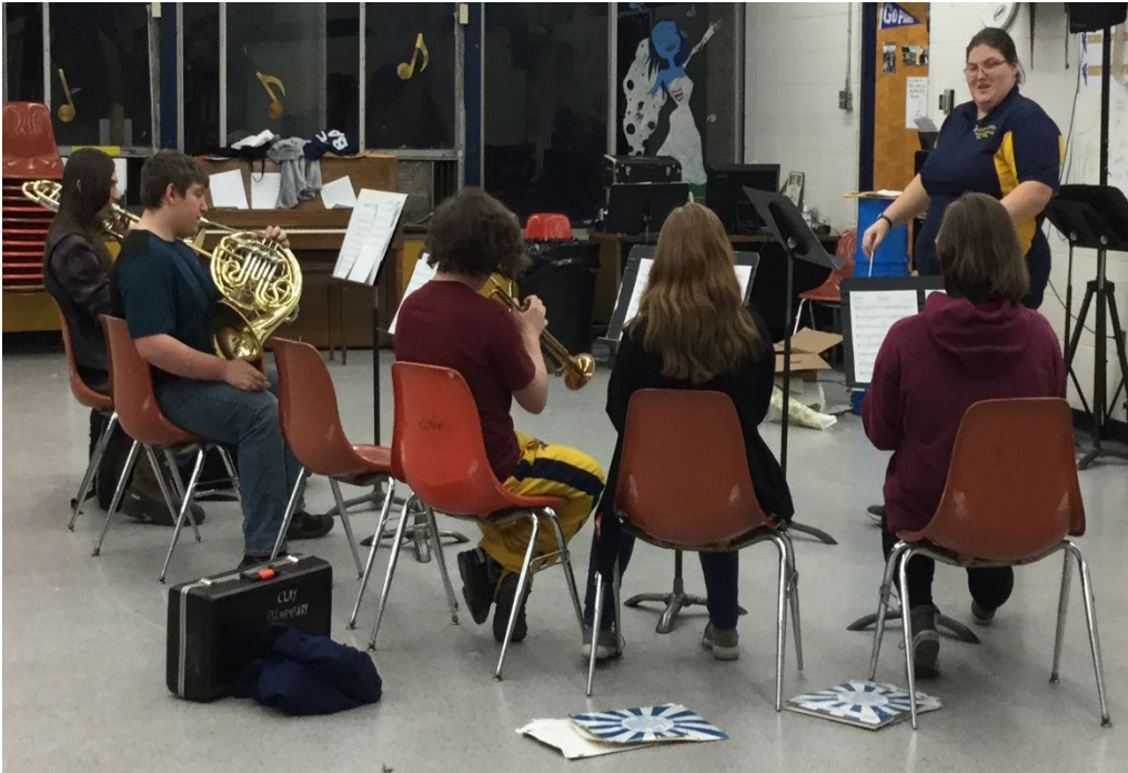
Members of Clay County High School's Brass Ensemble practice.

Students at H.E. White Elementary struggle to conquer the cup stacking challenge. Could you restack the cups using only yarn and a rubber band and without touching the cups with your hands?