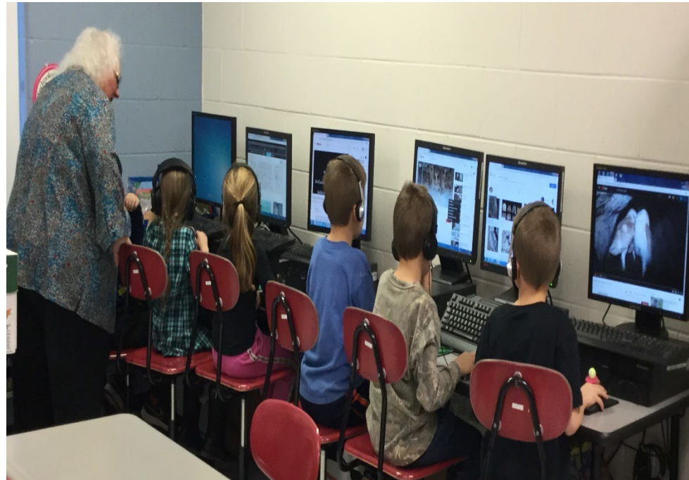
Students at Big Otter Elementary learn about owls as part of a STEM lesson.