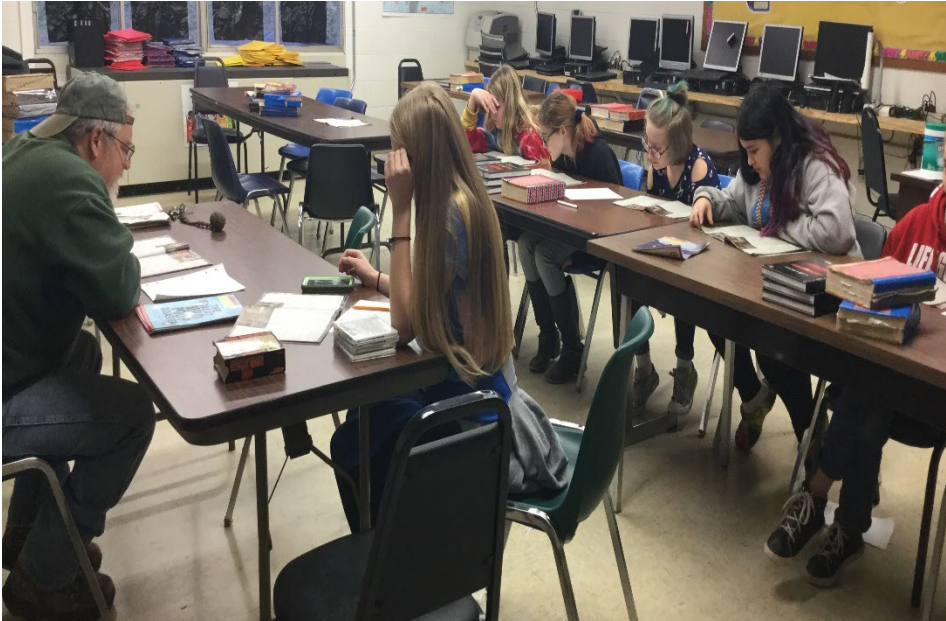
Clay Middle students rehearse the script for the radio show they will be recording.