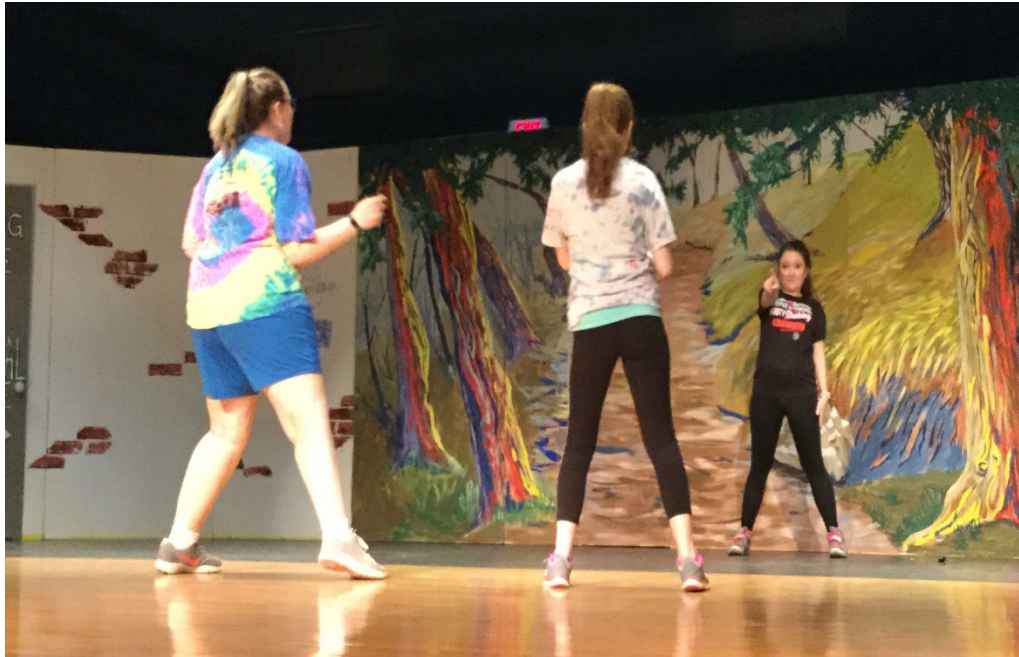
Clay High School students get fit with Zumba.