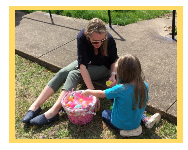
Family members were on hand to help open eggs and see the surprises that waited inside.